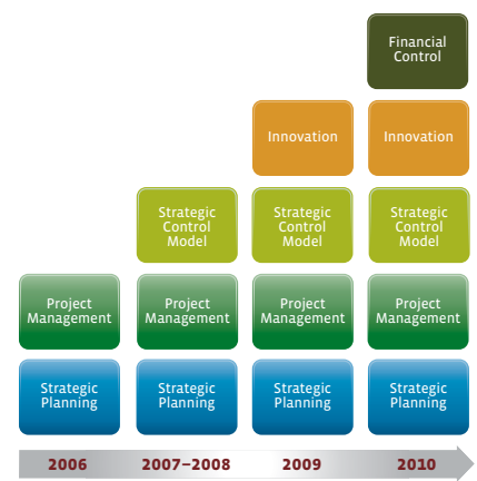
FIGURE 4: EVOLUTION OF RESPONSIBILITIES OF BANCOESTADO MICROEMPRESAS'S OSM

During this evolution, BancoEstado's OSM grew from three FTEs in 2006 to 11. In addition to hosting strategic management meetings, this OSM convenes strategic learning workshops in which management teams meet to share